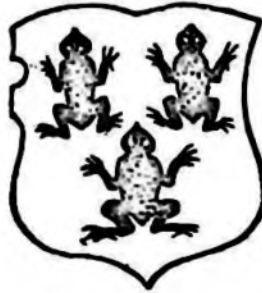
[This is the Olde Arms of France.]

2. The second engraving (which is a shield with three frogs on the face of it) is from Pynson's Edition of Fayban's Chronicle .