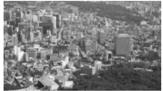
Seoul, capital city of Korea.

Korea). We presented the background of the Conference and the College including the Abrahamic Faith and the school system, which is much different than that of Korea. We also presented video taped material of classes, facility, staff members, and other student activities such as, having authentic Korean food for lunch, etc.