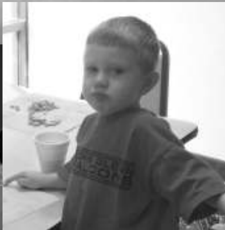
One of our "little guests" at CWS