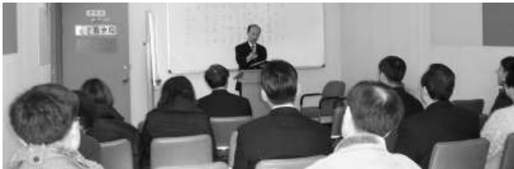
Seminar for Pastors in Korea.