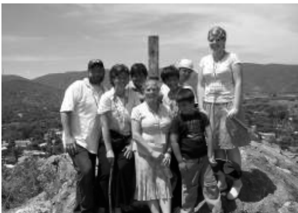
The Mexico Ministry Team.