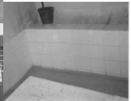
▲A permanent baptistery was constructed in the church building in Lima.