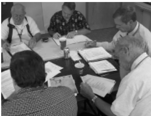
Board of Directors meeting.