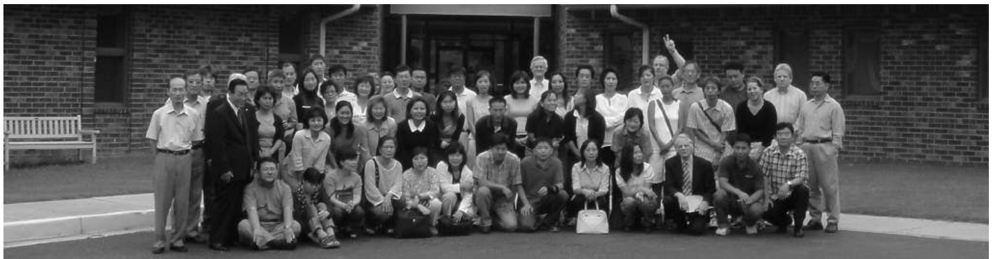
Atlanta Bible College Korean Extension students and faculty.

Presently, our prayer is to have 120 students for the Fall Semester and we are actually preparing to accommodate that number of students. Please, don't forget to include the Korean Extension ministry in your prayer list. Thank you very much and God bless you and your ministry. ■