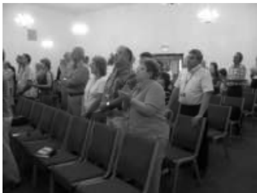
General Conference worship.